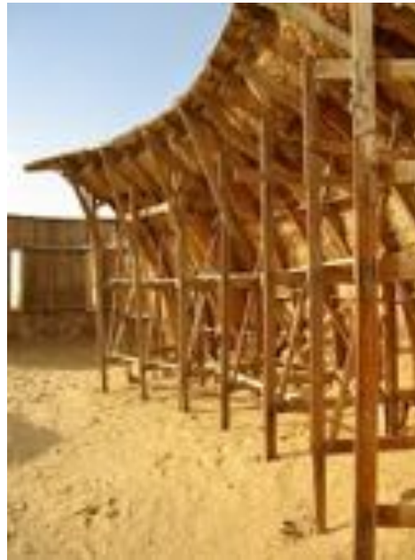
Turned around (read the terms)