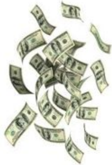
Understand (part of) the business